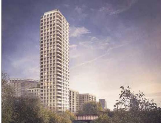
Artist impression of Plot A

The major concern of the Society is the current application No 2022/3954 for the redevelopment of the former gasholder site adjoining Armoury Way in central Wandsworth.