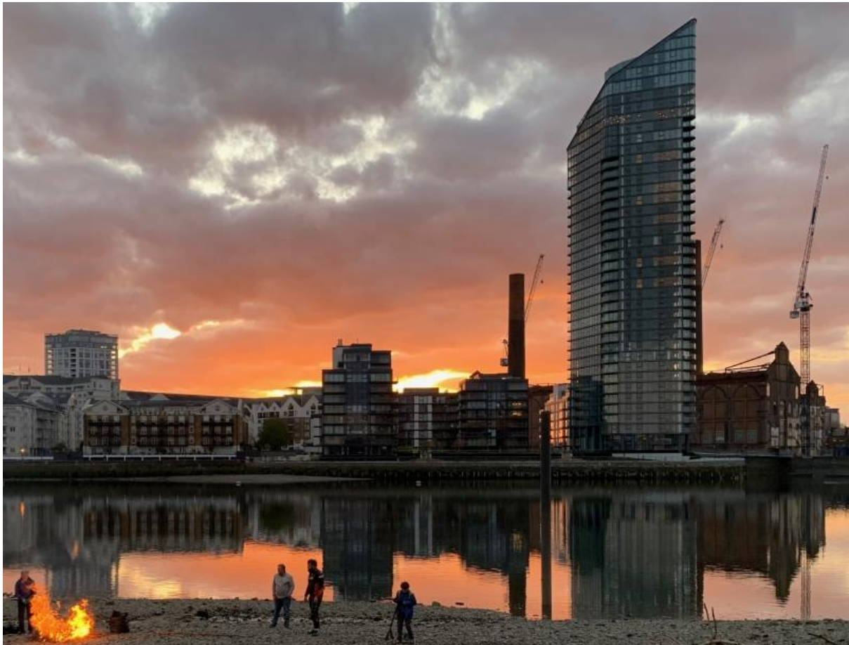
Lots Road Power station

The Battersea Society is pleased to announce that it's just launched its second photo competition in partnership with the Royal College of Art, this time on the theme Battersea Past Present & Future. This is open to all amateur photographers, of all ages; do please think about entering yourself, and spread the news to anyone else who might be interested. The competition runs until 31 August 2023 and entrants can submit up to three photos, to be taken within Battersea and fit into one of the three competition categories: Battersea Past, Battersea Present and Battersea Future. There are cash prizes on offer and we'll be putting on an exhibition of finalists' entries at the RCA's Battersea campus in early October.