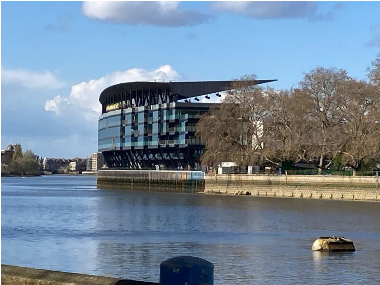
Fulham Football Club

Fulham Football Club was granted planning permission for the redevelopment of its Riverside stand in March 2018. Work began in 2019 and the towering structure of a stand with an ultimate 8650 capacity now dominates the skyline at the upstream end of Bishops Park. The barges and cranes have gone, and the external work is finished. The structure is still undergoing some internal refitting; the lower half of the stand is now used at matches and the project is expected to be completed in time for the 2023-4 season.