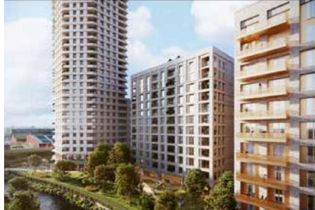
Artist impression of Plot A1, A2 & A3