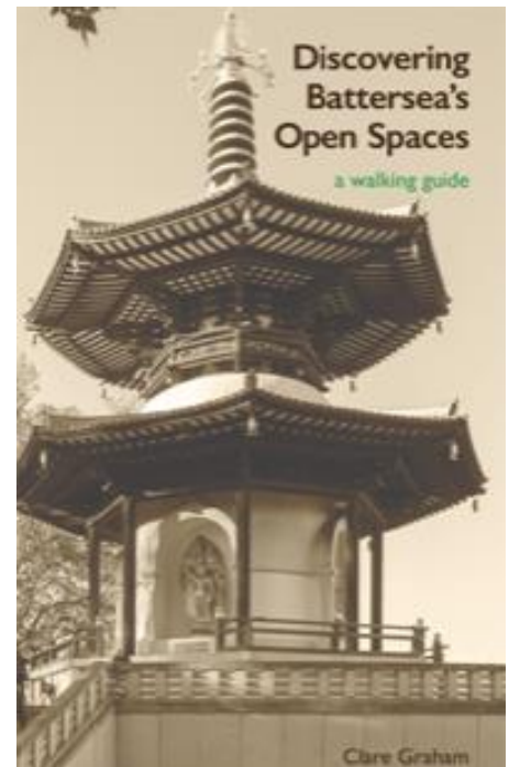
Battersea's Society Walks Booklet

Moorings . So far as current development activity on the Thames Riverside goes, our planning committee's chair reports that her main area of concern is moorings. My impression is that they are growing like Topsy, extending and not always in a beneficial